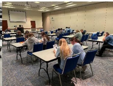
Reading, Interpretation & Writing